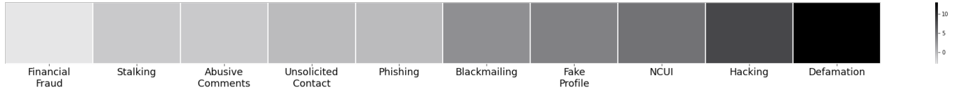
Figure 2: Female Spectrum about Cyberthreats

and Fake Profile to be more severe. Male and Female Participants both considered Stalking, Abusive Comments, and Unsolicited Contact to be less severe. Female participants also considered Financial Fraud to be less severe, which is in contrast to the male spectrum. In the subsections below we unpack and contextualize the spectrum based on the experiences and concerns expressed by the participants along with the prevalent socio-cultural norms based on our qualitative study.