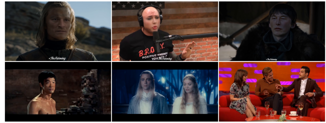
Figure 1: Frame samples of deepfake videos in the wild (YouTube).

A deepfake video is popularly characterized as a video that has been manipulated using deep neural networks (DNNs), with the goal of