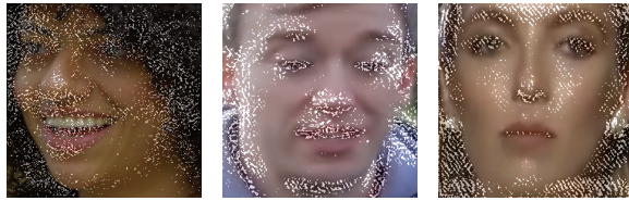
Figure 4: Visualization of salient regions (white dots) as determined by CapsuleForensics, and highlighted using Int-Grad [56]. The first image is a fake face correctly classified as fake, and shows no-discernible-features. The second image is a real face correctly classified as real, and shows face boundary features. The third image is a fake face classified as real, and shows salient background features. Note that these are significant features, and do not preclude insignificant features such as those around the eyes and nose.